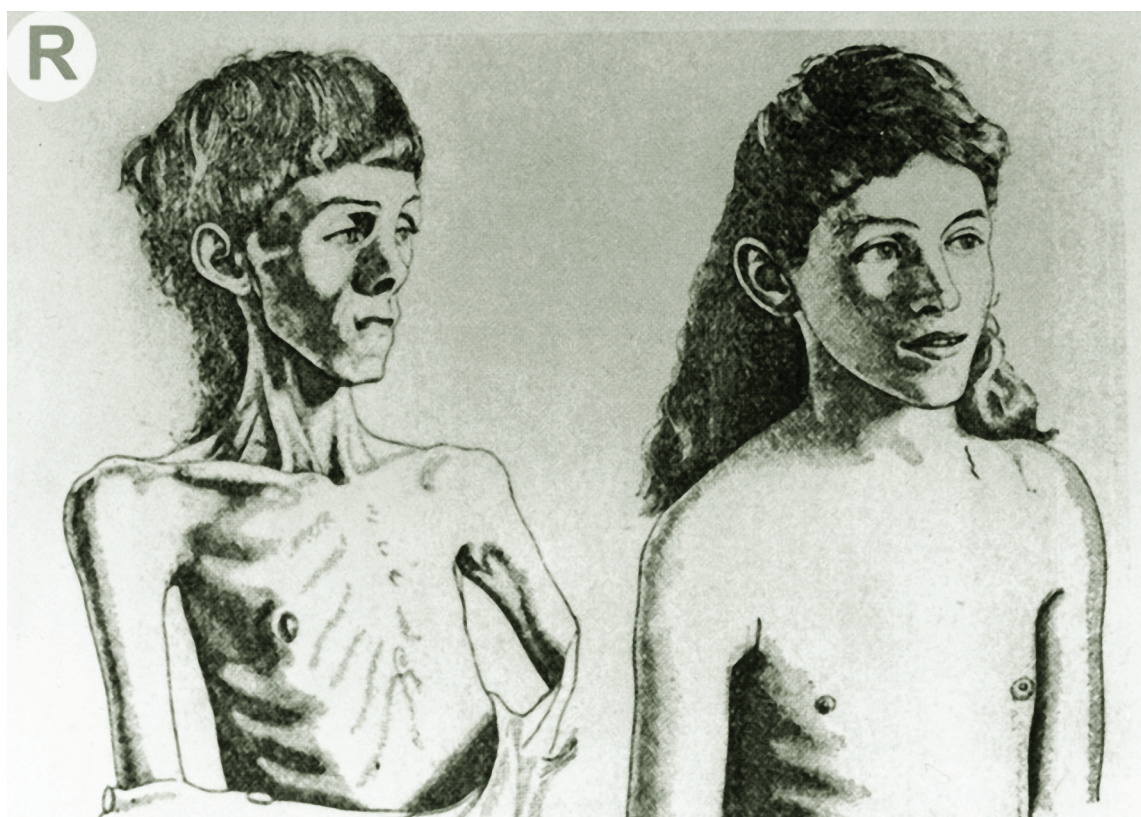
Fig. 1. Physicians isolated self-starvation in the 1870s. The condition was named 'anorexia nervosa' by William Gull; these drawings are from his article in the first volume of The Lancet (1888).